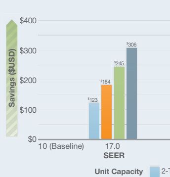
Annual Energy Cost Savings for Cooling 10-SEER Baseline*